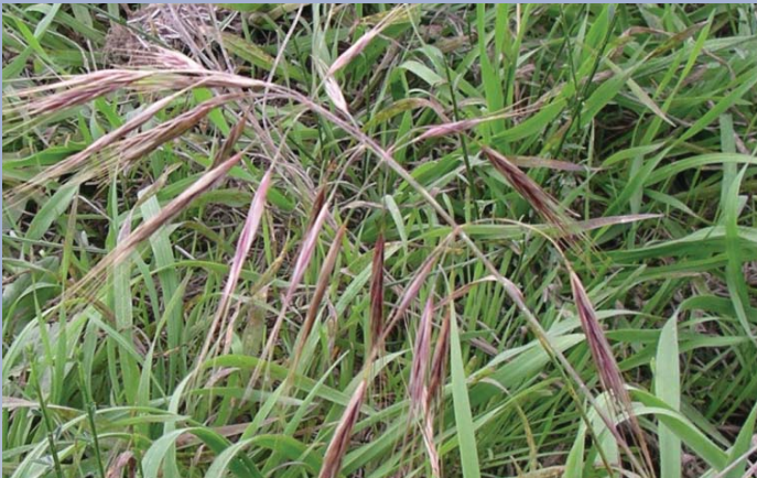
Above: Ripgut brome mature plants and seedhead.

Ripgut brome looks like many other annual grasses before seedheads are visible. The leaves are hairy and slightly twisted. Plants often have a reddish brown tinge, and red colouration at the base. Ripgut brome seeds are large (awn up to 6 cm long) in comparison with seeds of other annual grasses, hard and sharp. They have a long awn protruding from the end of the seed. Small hooks on the edge of seeds pull seeds down into the wool and carcass.