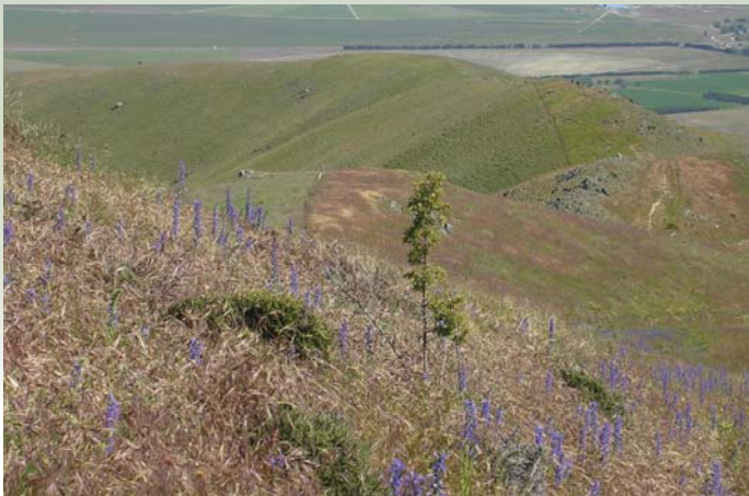
Ripgut brome growing on north facing slopes.

Ripgut brome is an annual grass weed that is prevalent on dry hill and high country sites throughout parts of Canterbury, Otago and Marlborough.