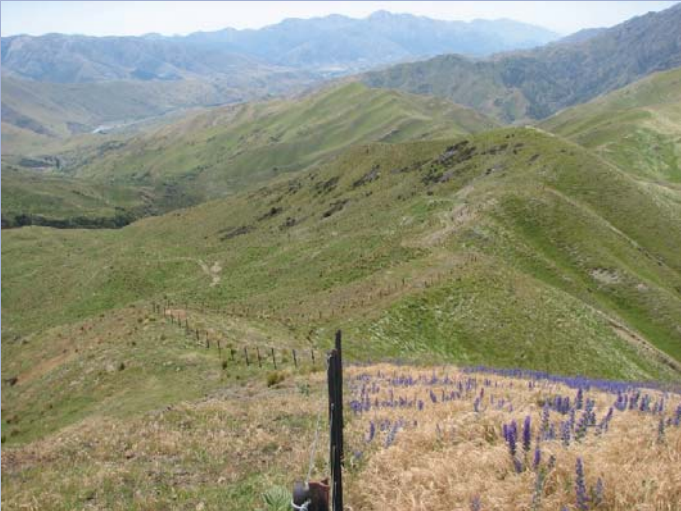
Sheep grazing has reduced ripgut brome seedhead formation (left). This is in strong contrast to the paddock on the right with lax grazing.

Herbicides: Apply herbicides to localised patches of ripgut brome (e.g. stock camps, ridges). Full rates of knockdown herbicides such as glyphosate and paraquat kill all existing vegetation and create bare ground patches that are likely to be invaded by other weeds. Spray-topping (chemical topping) with glyphosate in mid spring (at early grass seedhead emergence) may limit seedhead production and reduce seed viability. Do not use a surfactant. Temporary pasture brownout will occur. Spray-topping does not kill the plants but prevents seeds from forming. Repeat herbicide applications will be necessary because some seeds persist for more than one year in soil. Combine with oversowing of desirable species in autumn to avoid re-invasion by ripgut brome.