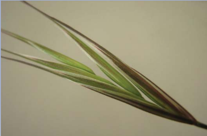
Above: Ripgut brome seeds.

Ripgut brome is an annual grass weed, meaning it completes its lifecycle in one year. Seedheads are formed during early summer, with seeds staying in seedhead for several months. A majority of seeds that are dispersed germinate in the first year, with a small proportion persisting in the soil seed bank for greater than one year.