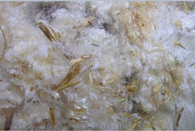
Ripgut brome seed in a carcass and wool.

This causes reduced growth rates for affected animals and may lead to the downgrading of wool and meat products. Further losses are incurred by the meat processor through reduced throughput of carcasses.