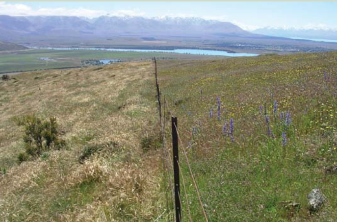
Ripgut brome is prevalent on stock camps on sunny faces. The paddock on the left was also grazed more leniently.

Lifecycle: Ripgut brome germinates in autumn, overwinters as a small plant and produces mature seed during late spring and summer