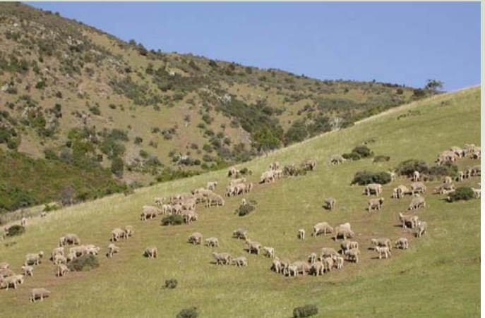
Sheep grazing intensively in areas where salt was applied